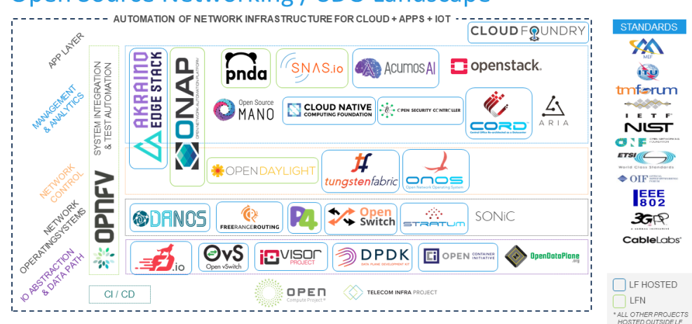
Figure 2 below introduces a high-level OS-N&O architecture, which maps standards, open source projects, and open reference architectures.

In 2017, the Linux Foundation proposed a unified open architecture for a Networking and Orchestration project, as indicated below. The architecture is intended to clarify how the many OS-N&O projects and standards relate to one another, and offer a starting point for much broader harmonization.